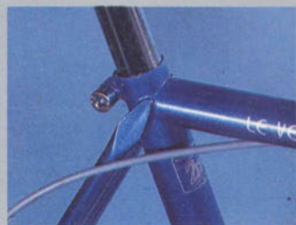
Brazed-on seat post clamp