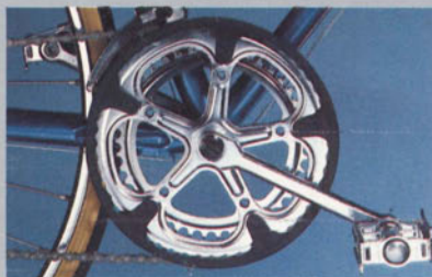
SOLIDA by STRONGLIGHT