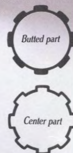
Ultimate Ultrastrong tubing